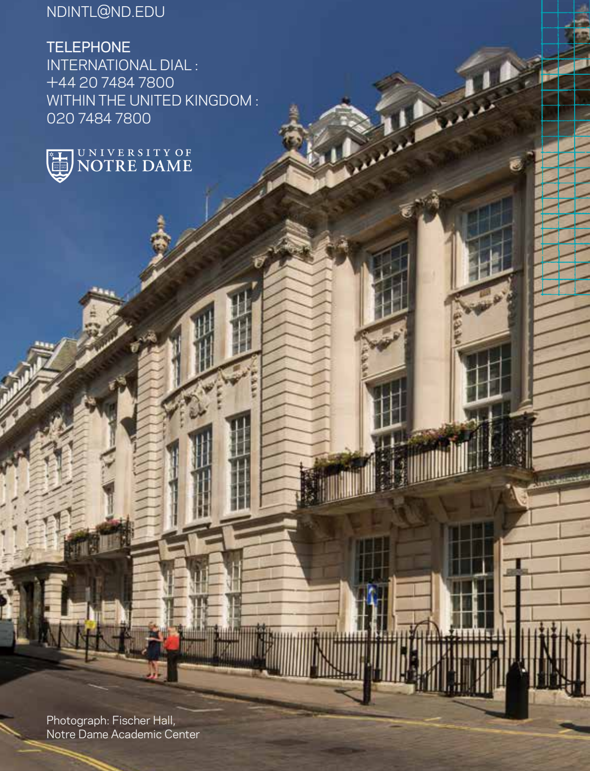
Photograph: Fischer Hall, Notre Dame Academic Center