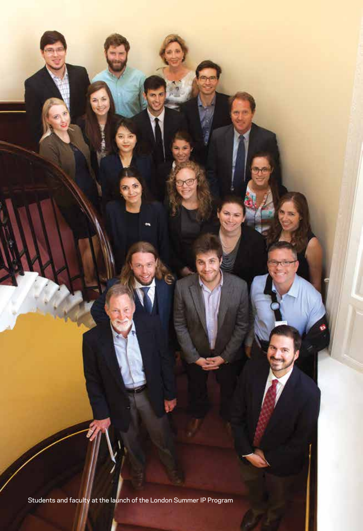
Students and faculty at the launch of the London Summer IP Program